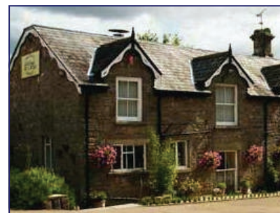
The Inn at Penallt www.theinnatpenallt.co.uk 01600 772765 Bar meals: Friday and weekends, plus Wednesday & Thursday in summer 12 noon to 3:00pm

a field. Go on through a gate, past a converted barn and down an old green lane with some large oak trees, a gate part way down and walls of huge stones. At the bottom (9), next to a house, cross the track coming in from the left and go over the stile, continuing up through a young woodland on a permissive track and over a stile on to a road. Cross the road and continue up the stony gully and path to another road.