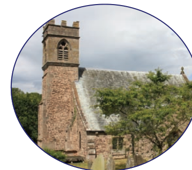
Church of St Michael and All Angels